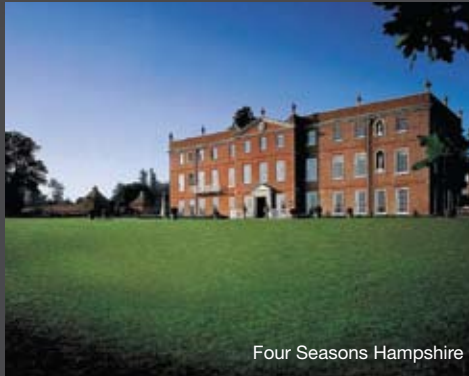
Four Seasons Hampshire